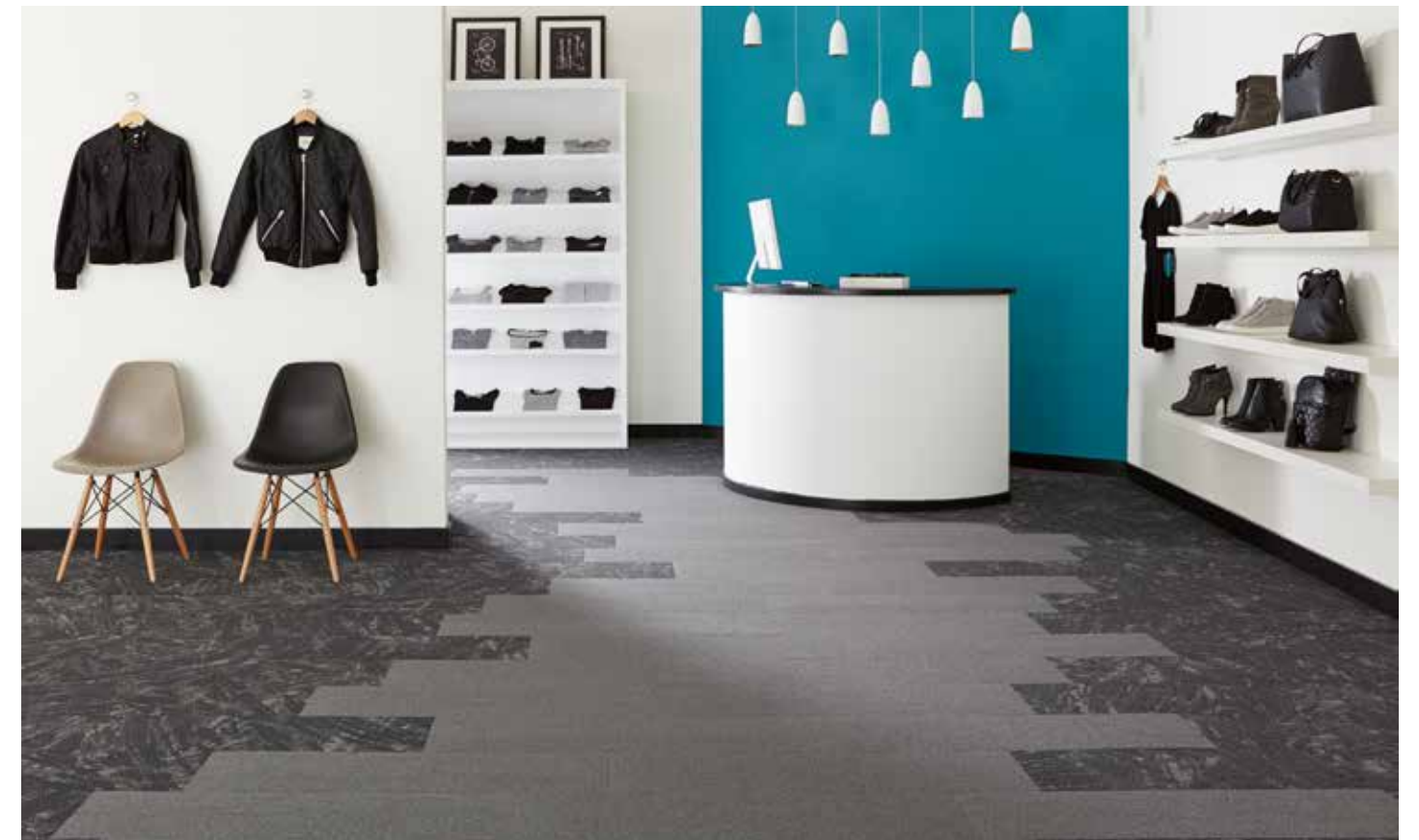
Formwork in Abacus with Talus in Galena, 25cm x 1m ashlar planks