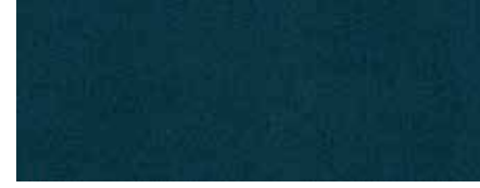
FWK229 OCEAN DEPTH