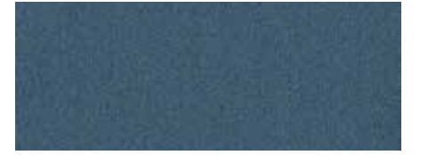
FWK126 FRENCH BLUE