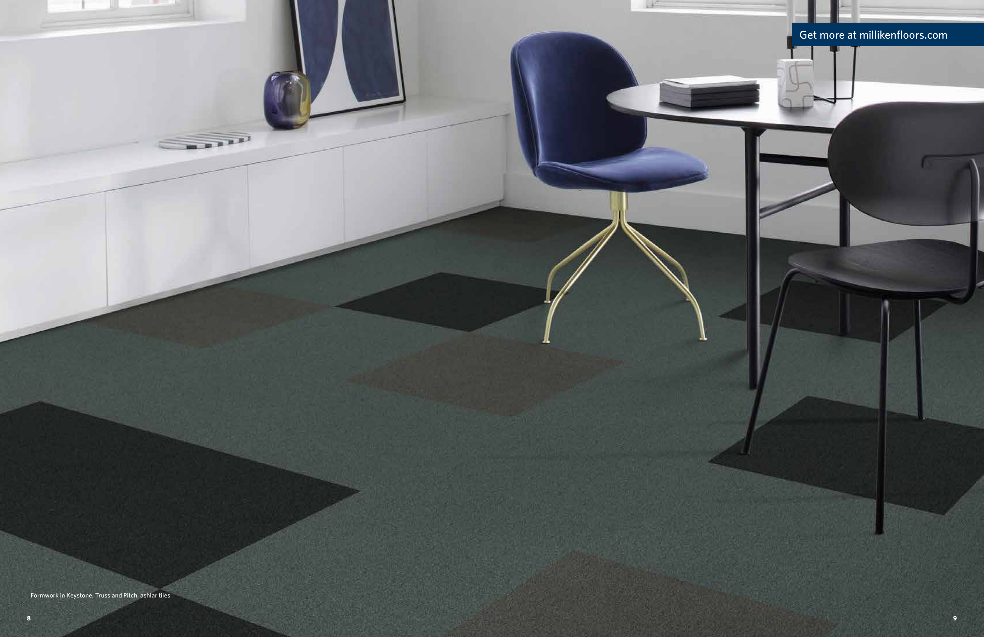
Formwork in Keystone, Truss and Pitch, ashlar tiles