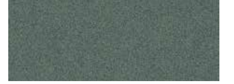
FWK101 SEA FOAM