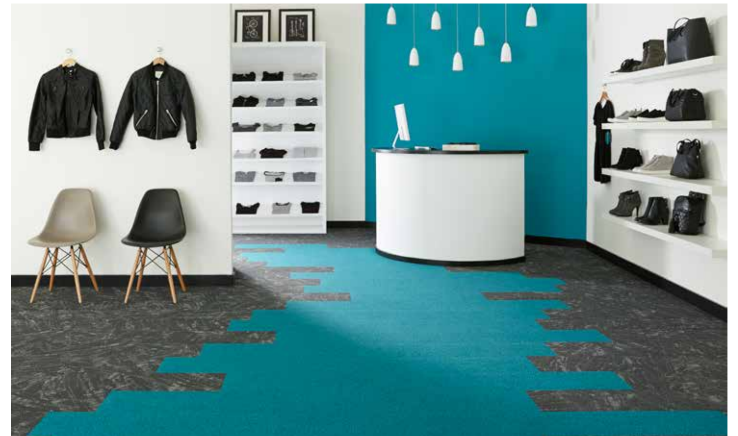
Formwork in Aquamarine with Talus in Galena, 25cm x 1m ashlar planks