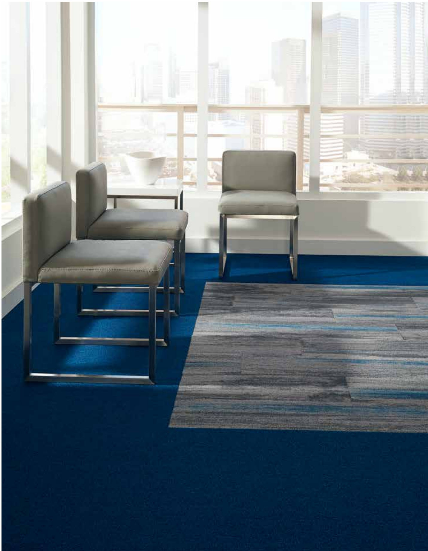
Formwork in Midnight, monolithic tile installation, with Color Field in Felt Grey and Dry Dock, vertical ashlar planks