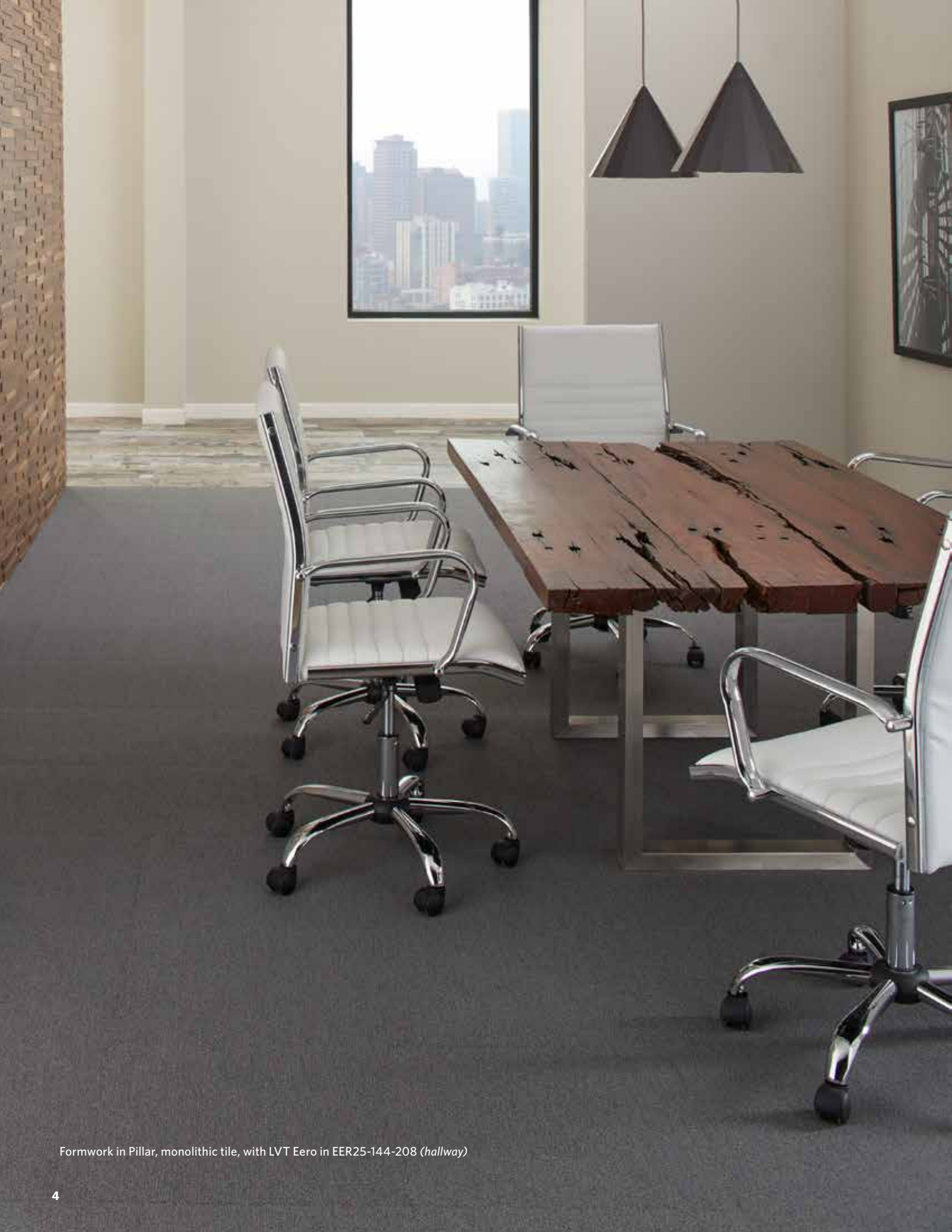
Formwork in Pillar, monolithic tile, with LVT Eero in EER25-144-208 (hallway)