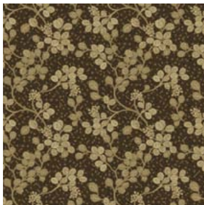
36" MODULAR TILE — SMALL SCALE Order #: 00134080 Single Tile Repeat — 36.00" W x 36.00" L