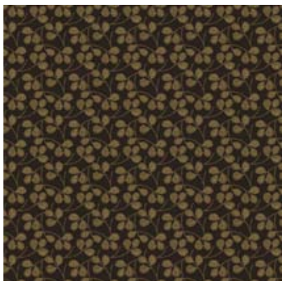
36" MODULAR TILE — OUTFILL Order #: 00134079 Single Tile Repeat — 36.00" W x 36.00" L