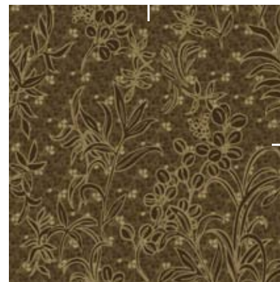
36" MODULAR TILE — LARGE SCALE Order #: 00138672 Four Tile Repeat — 72.00" W x 72.00" L TOP LEFT Order #: 00138672_001 TOP RIGHT Order #: 00138672_002 BOTTOM LEFT Order #: 00138672_003 BOTTOM RIGHT Order #: 00138672_004