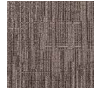
SCA95-27 BEST FIT