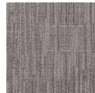
SCA79-108 HALF SPACE