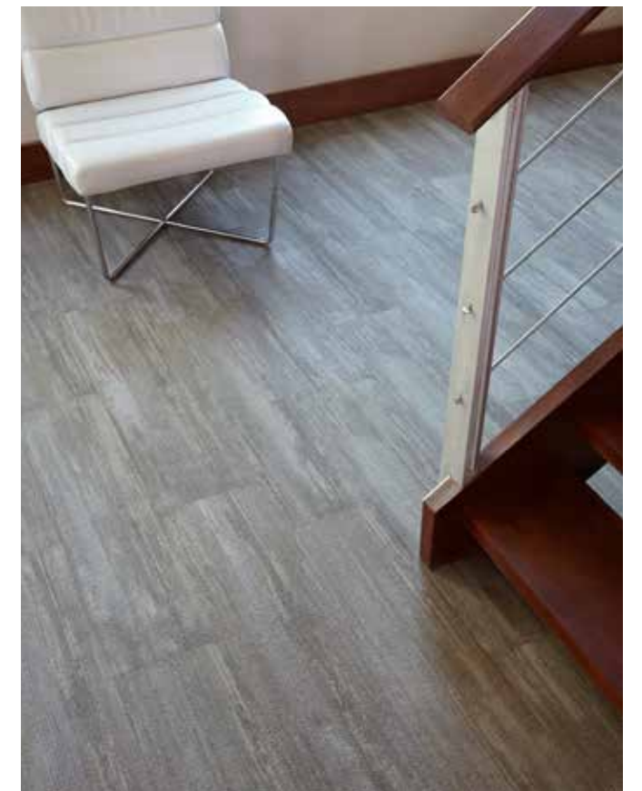
Color Field in Birch Shadow, 25cm x 1m ashlar tile installation