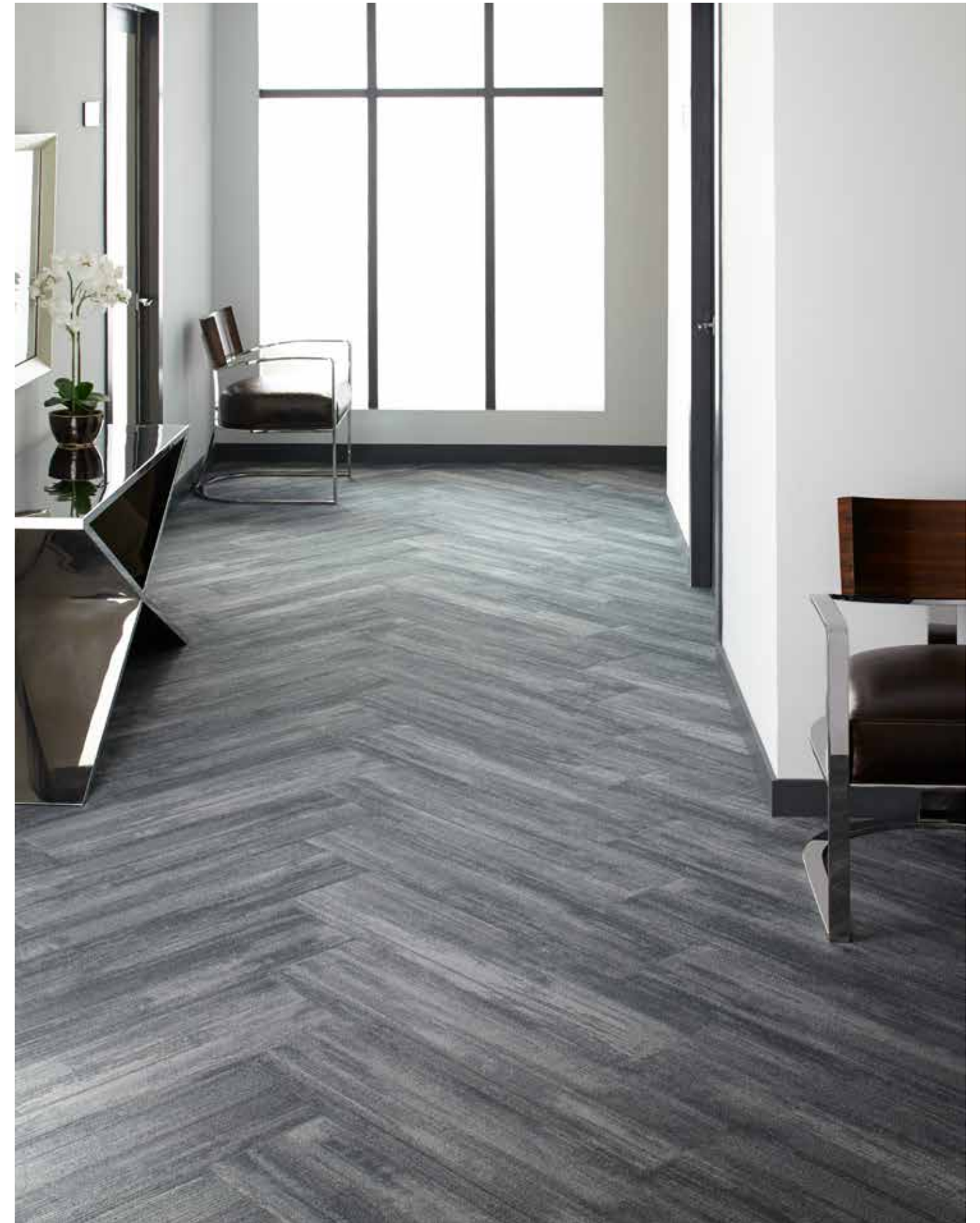
Color Field in Rune, 25cm x 1m herringbone tile installation