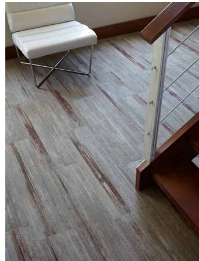
Color Field in Barnwood, 25cm x 1m ashlar tile installation