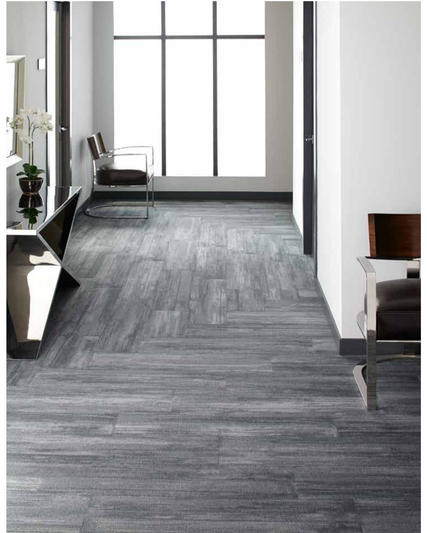
Color Field in Rune, 25cm x 1m ashlar tile installation