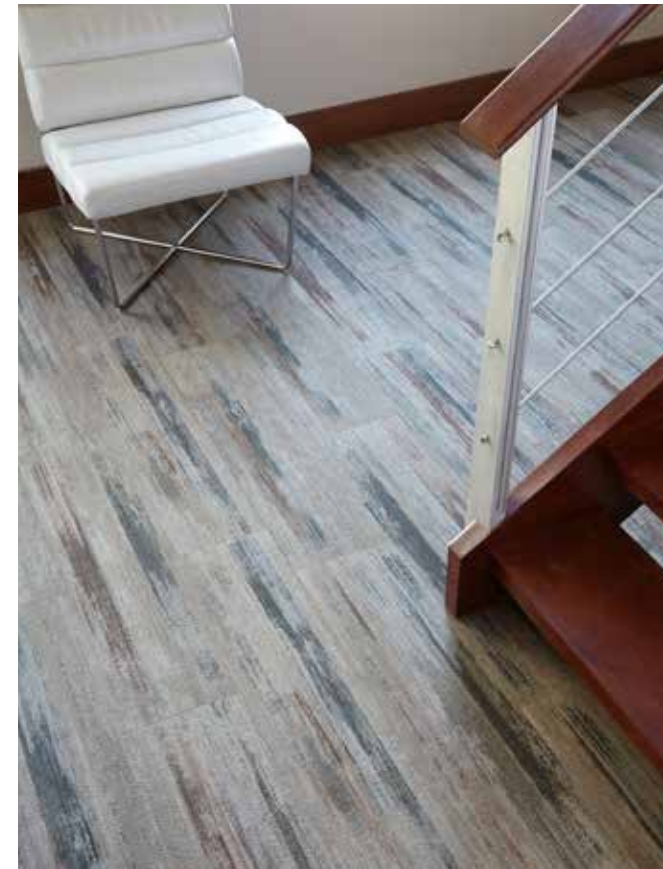
Color Field in Granite Moss, 25cm x 1m ashlar tile installation