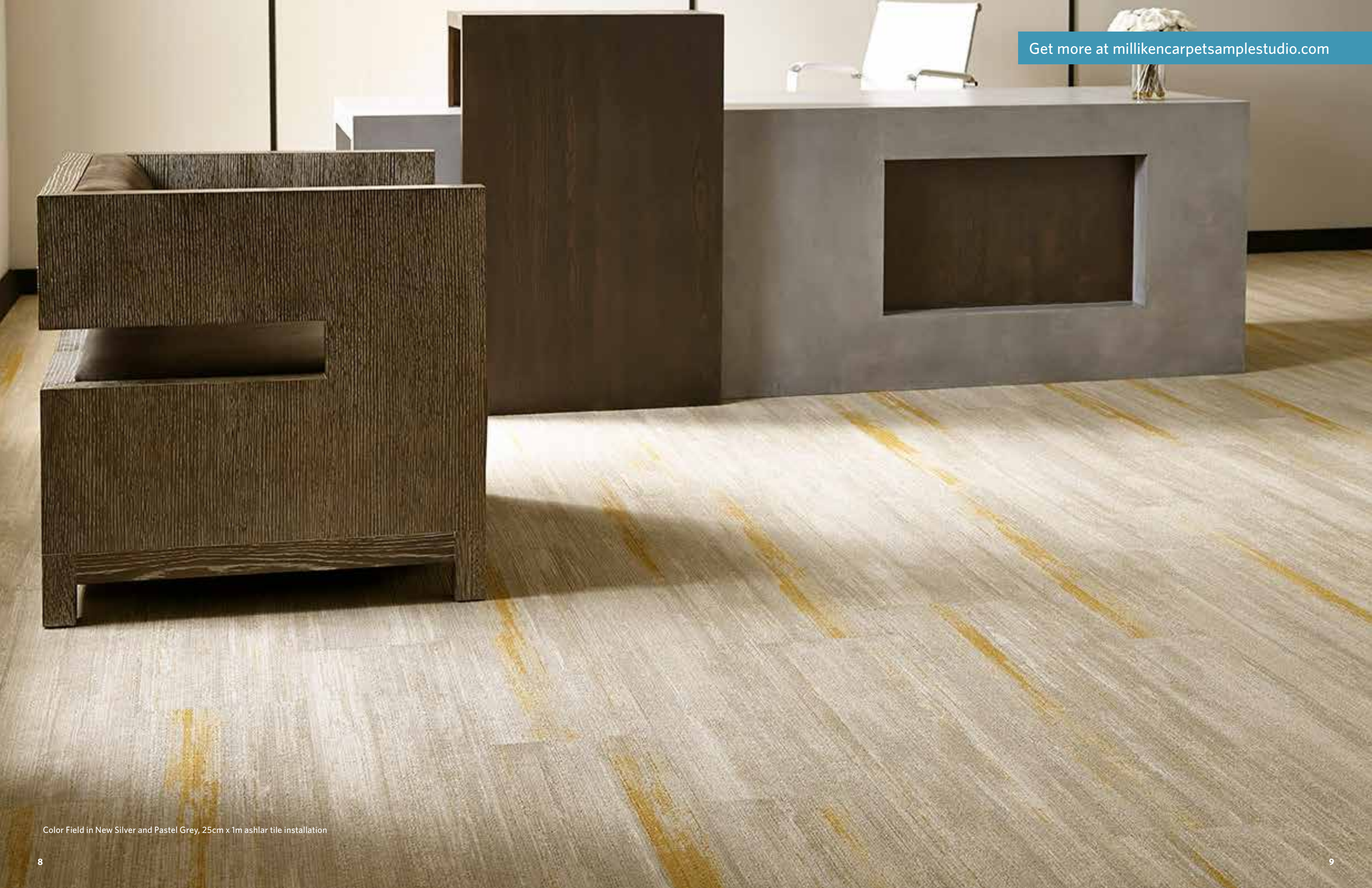
Color Field in New Silver and Pastel Grey, 25cm x 1m ashlar tile installation