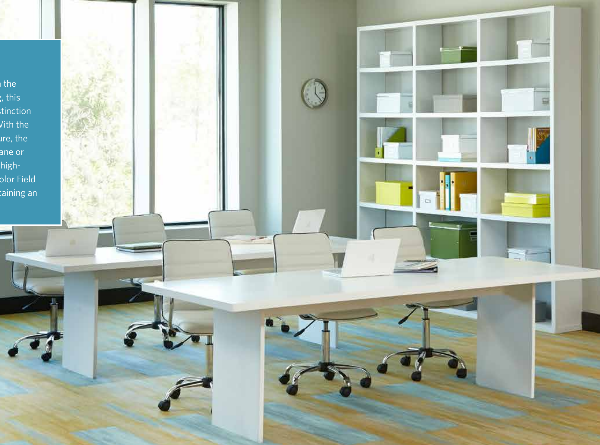
Color Field in Aqua Smoke and Streamside, 25cm x 1m ashlar tile installation

Inspired by the large swaths of color represented in the abstract expressionism style of 'color field' painting, this collection explores the details created when the distinction between subject and background are eliminated. With the ability to discern layers as if they were aged by nature, the collection offers 64 colors to create a quiet floor plane or allow punctuations of color with vibrant hues. This high-performance, severe-rated modular plank allows Color Field to stand-up to the most extreme traffic while maintaining an imaginative color palette.