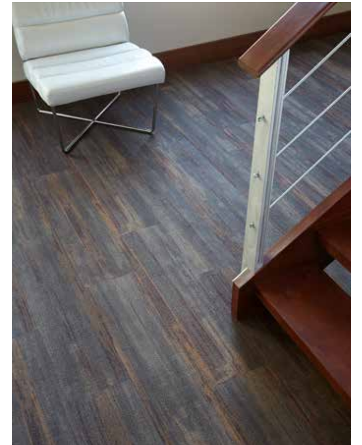
Color Field in Sorrel, 25cm x 1m ashlar tile installation